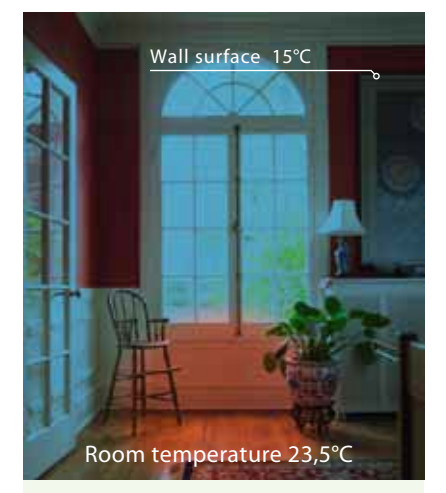
Before internal insulation: Cold walls – uncomfortable even with high internal temperature

At times of high humidity eg in bedrooms at night or when cooking, the buffering effect of wood fibre removes additional moisture without the risk of condensation forming. Thanks to the transfer of moisture due to capillary action buffered moisture is transported to the face of the board so that any evaporation can occur through the external wall or into the room itself. An additional vapour control layer is therefore not required.