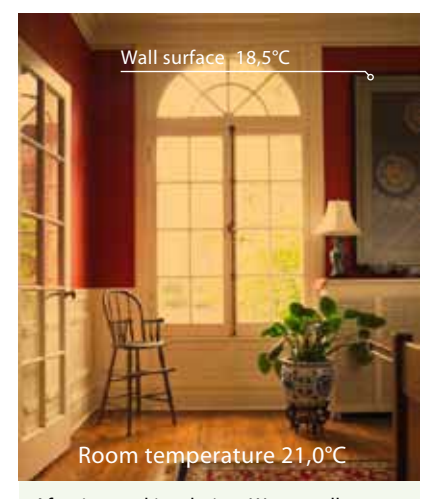
After internal insulation: Warm walls make for a comfortable room climate even at lower temperature

Insulating with Fibertherm internal greatly increase the internal wall surface temperature – another important protection against the possible build-up of mould. Rooms also feel significantly warmer if the wall surface temperature is higher. If the room feels warmer, then it is often possible to decrease the actual room temperature.